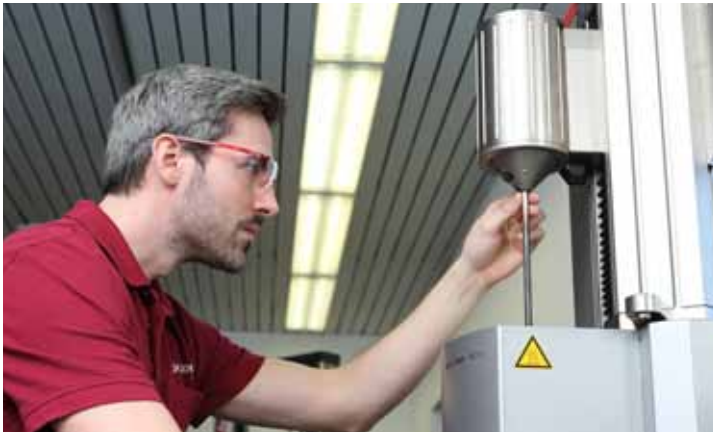
Comprehensive calibration service portfolio