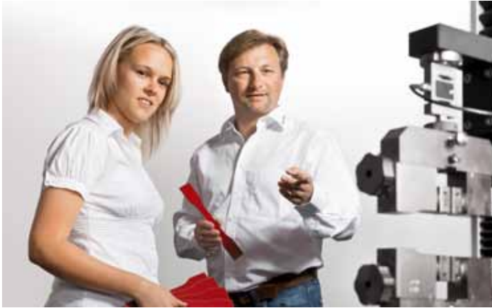
Advice on test methods and performing tests