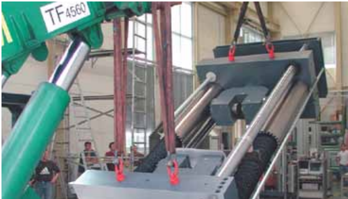
Specialist transport and relocation