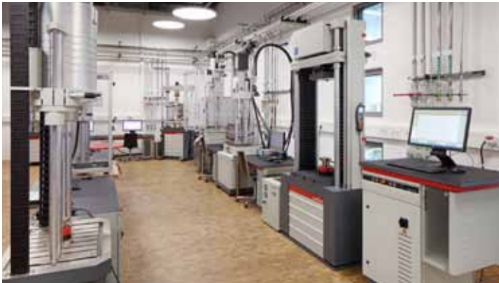
Dynamic fatigue testing laboratory