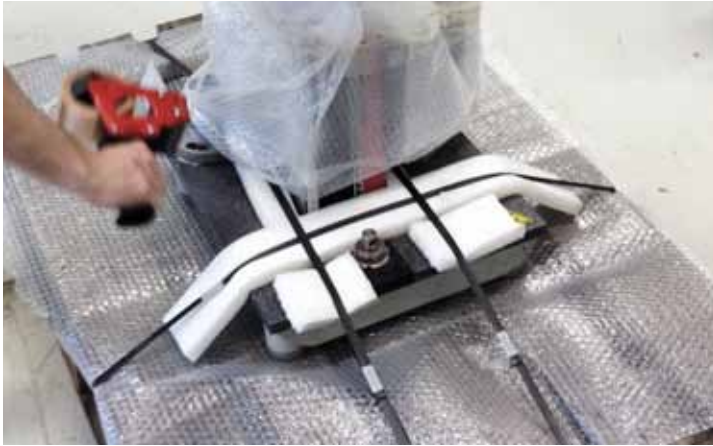
Professional transport preparations