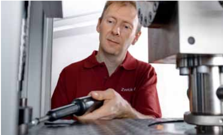
Adjustments during calibration