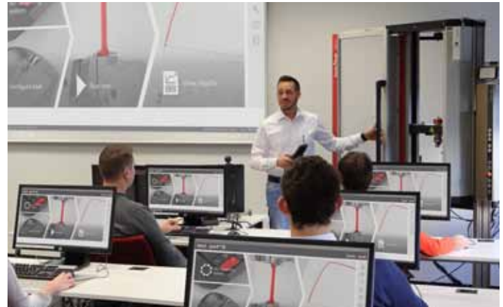
Small teaching groups provide optimum learning conditions