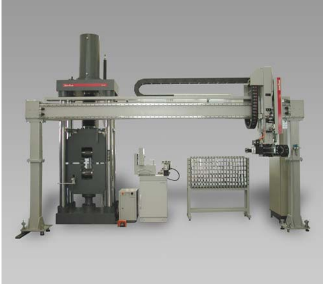
Pic 1: Robotic testing system 'roboTest P'