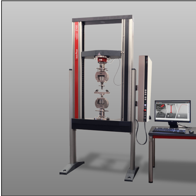
ZwickRoell Z100 modernized with testControl II