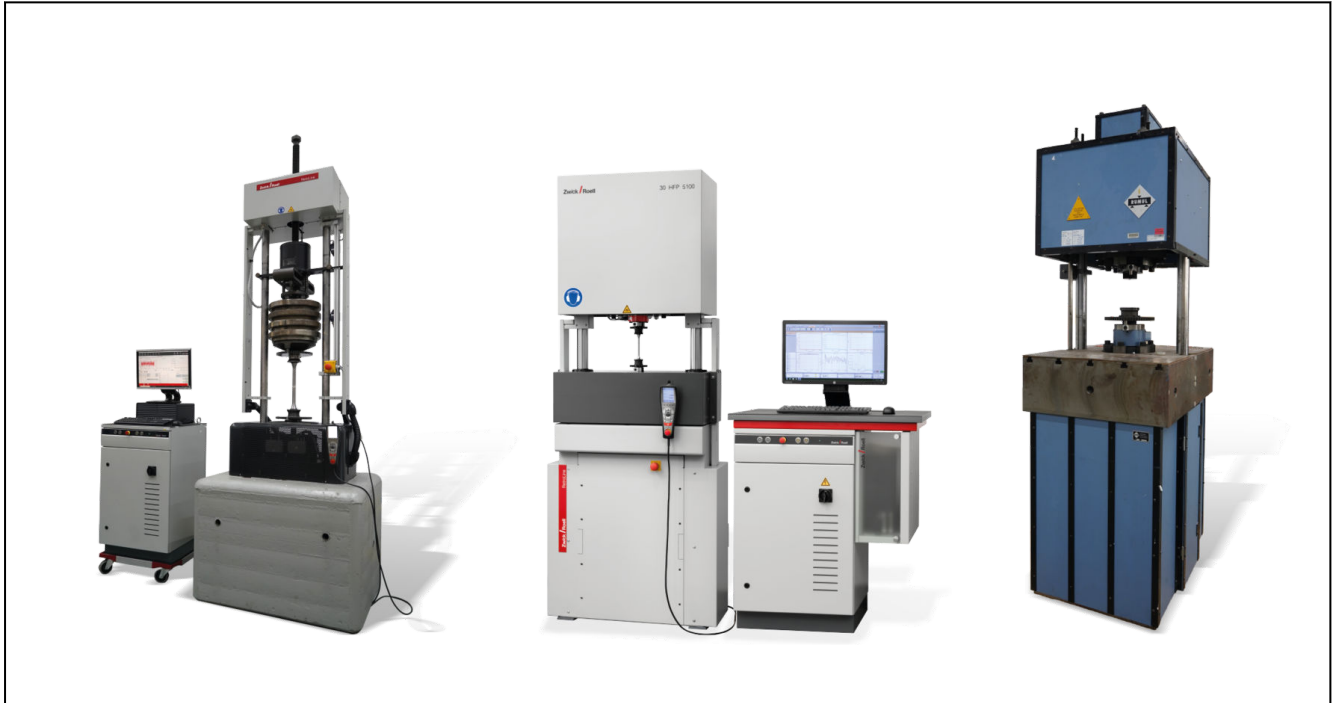
Manufacturer-independent modernizations of vibrophores