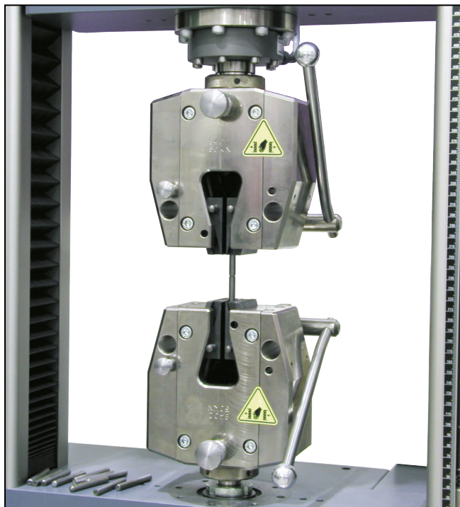
Wedge grips type 8402, Fmax 50 kN