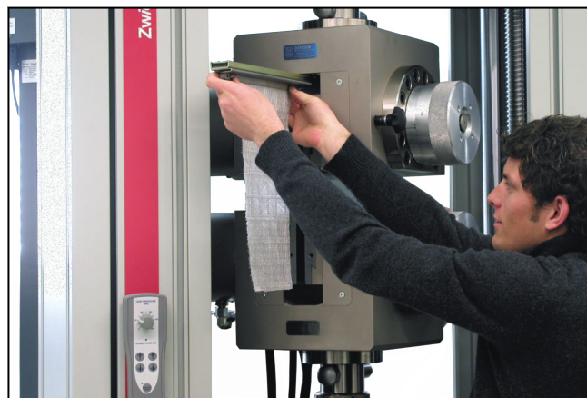
Inserting the specimen