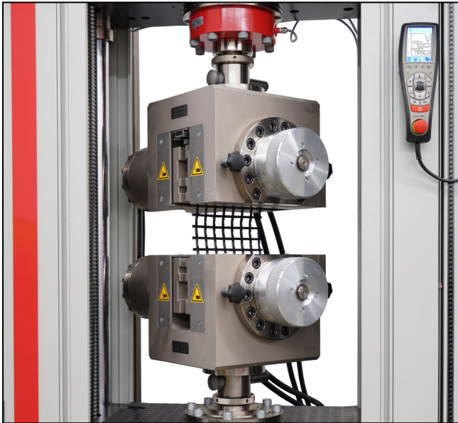
Type 8593 hydraulic grips, Fmax 250 kN