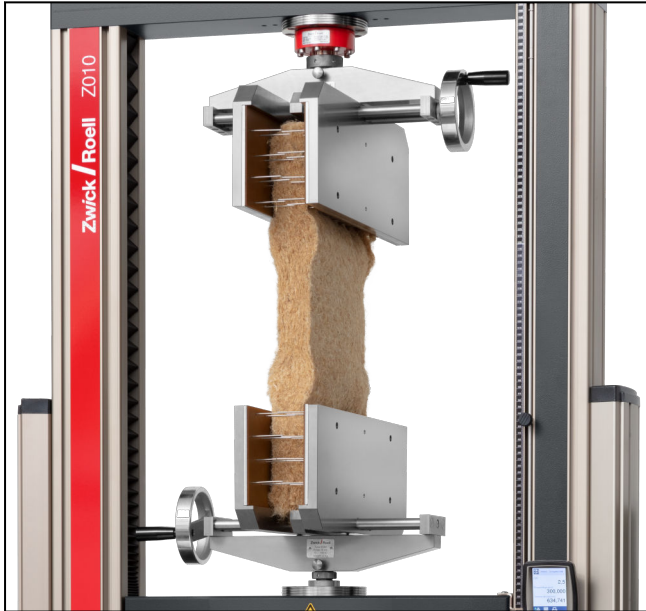
Type 8330 grips for insulating materials, Fmax 10 kN