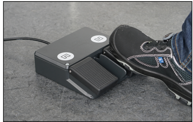
Pedal unit for opening and closing the pneumatic grips via foot operation