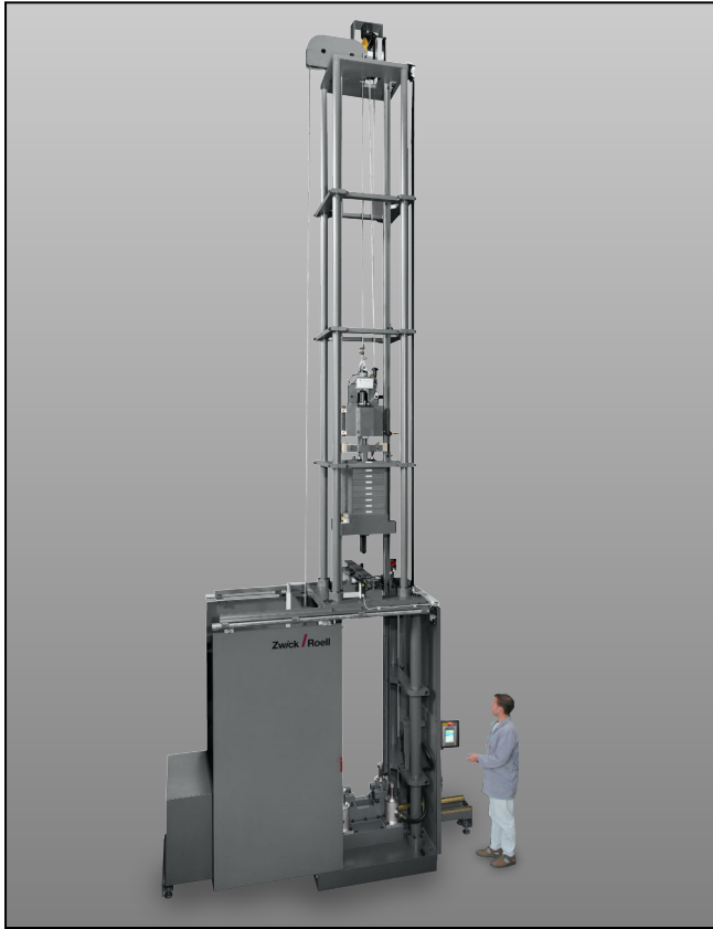
ZwickRoell high energy drop weight testers DWT40 with 5 m drop height