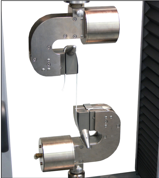
Capstan grips for high-strength plastic yarns type 8297, Fmax 2.5 kN