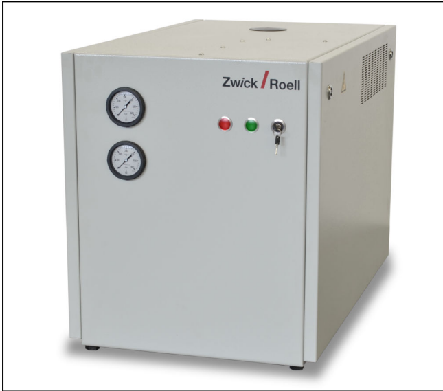
GripControl hydraulic power pack