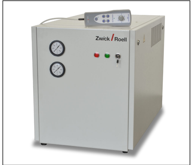
GripControl SA hydraulic power pack