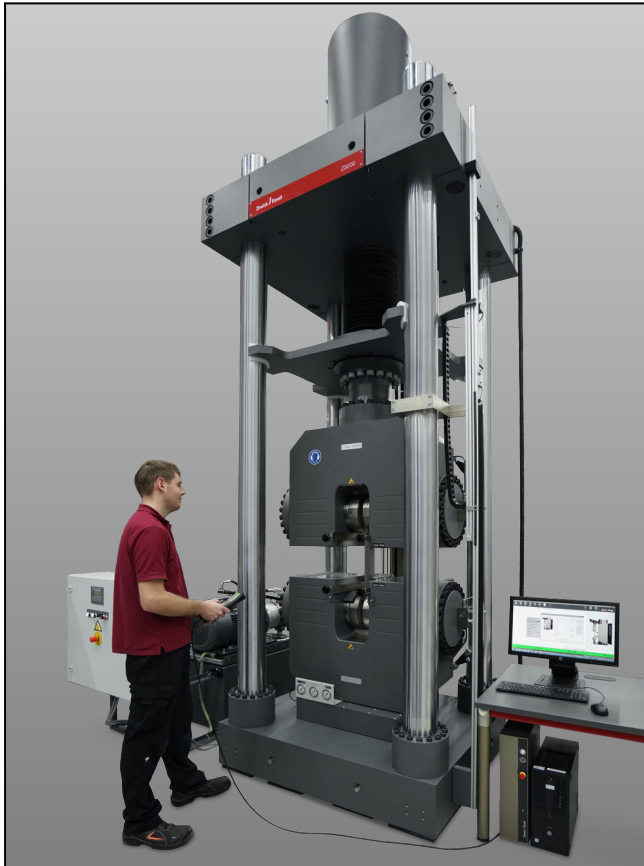
ZwickRoell Z3000H with hydraulic grips