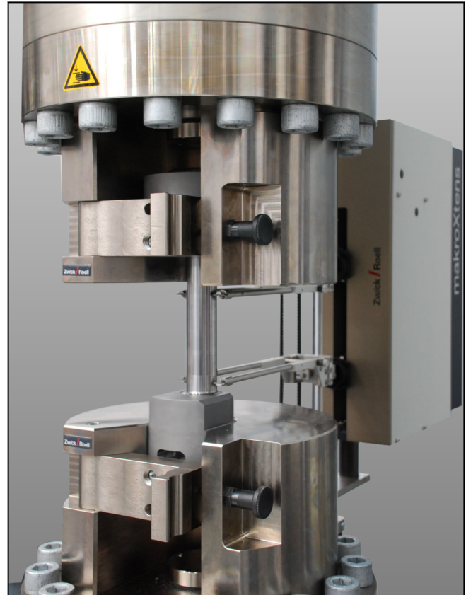
1200kN specimen grips with makroXtens extensometer on machined screw