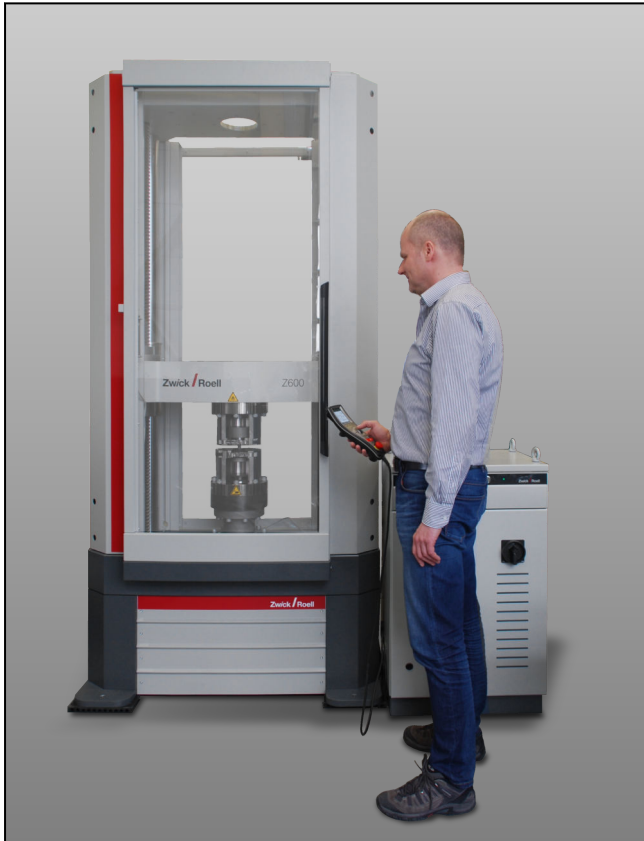
Z600E with grips for screws/bolts and button-head and threaded-end specimens