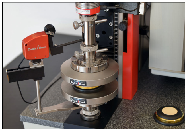
ZwickRoell displacement transducer with compression test