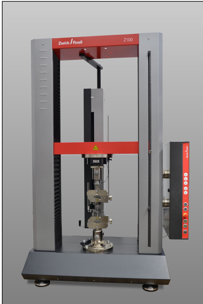
Long travel extensometers specially designed for ProLine testing systems