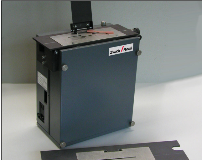
Automatic marking device, additional stencil for marking gauge lengths 50 to 100 mm