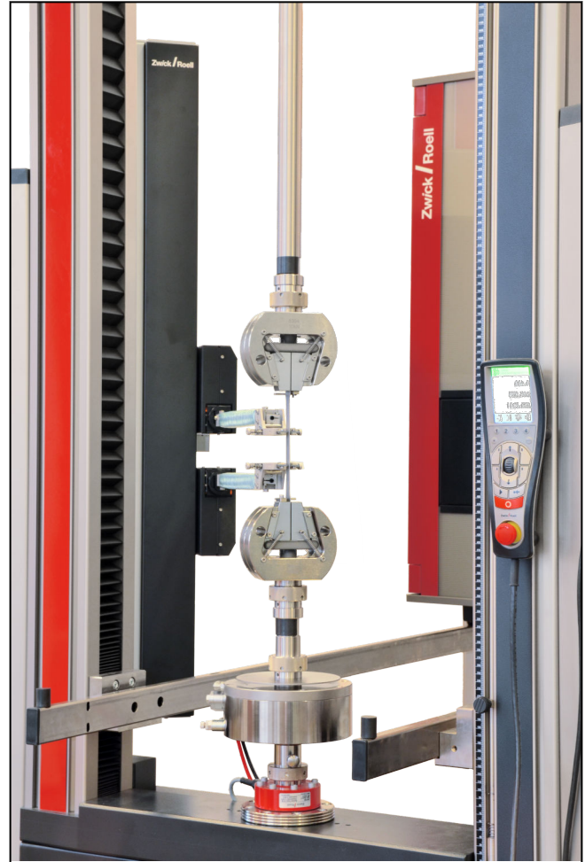
multiXtens II HP