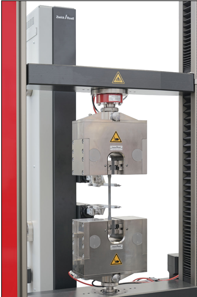
multiXtens II HP with two measurement carriages