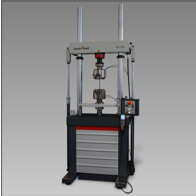
HA 100 on air springs with hydraulic wedge-grips