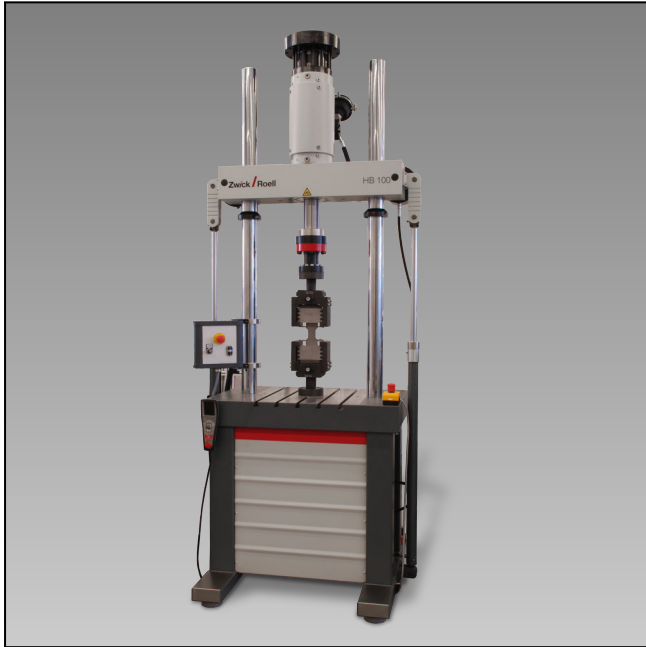
HB100 with T-slotted platform and mechanical grips