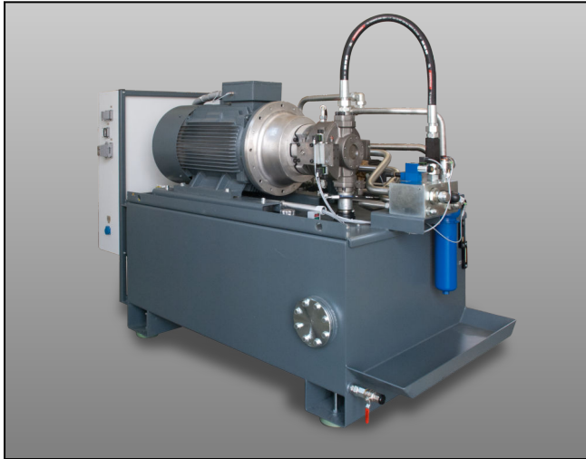
170-liter hydraulic power-pack without acoustic hood