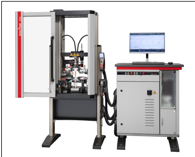
Autoinjector testing system AllroundLine 5 kN