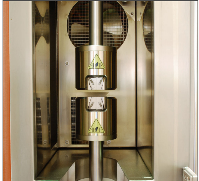
BOW-25 hydraulic wedge grips - temperature-chamber version

The grips are designed for 210 bar and can be connected to 210-bar and 280-bar systems via the grip control unit.