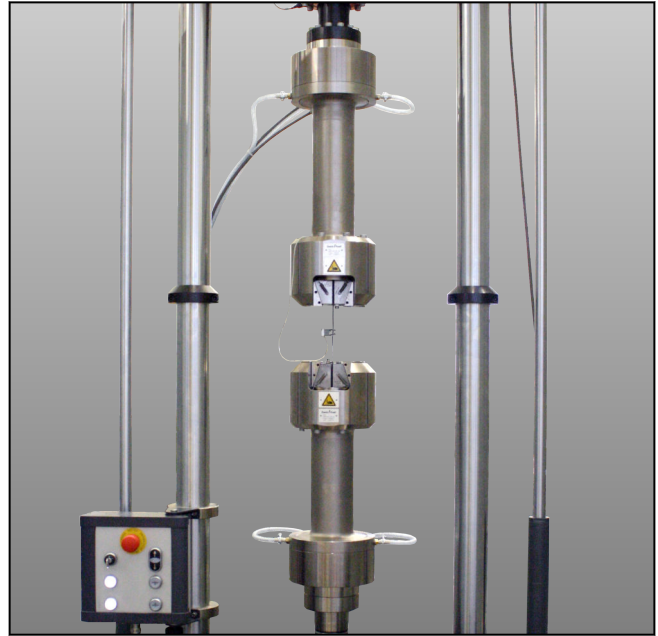
BOW-100 hydraulic wedge grips - temperature-chamber version