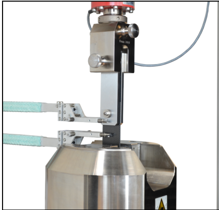
Bearing-strength test fixture as per AITM 1-0009 with specimen grips to hold the bearing-strength test fixture