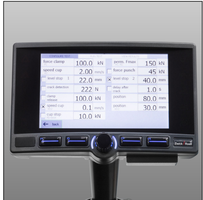
Display for BUP 400 / 600 / 1000 (1048583)