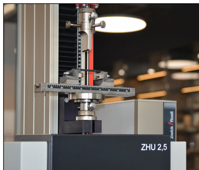
3-point-bending test on plastics