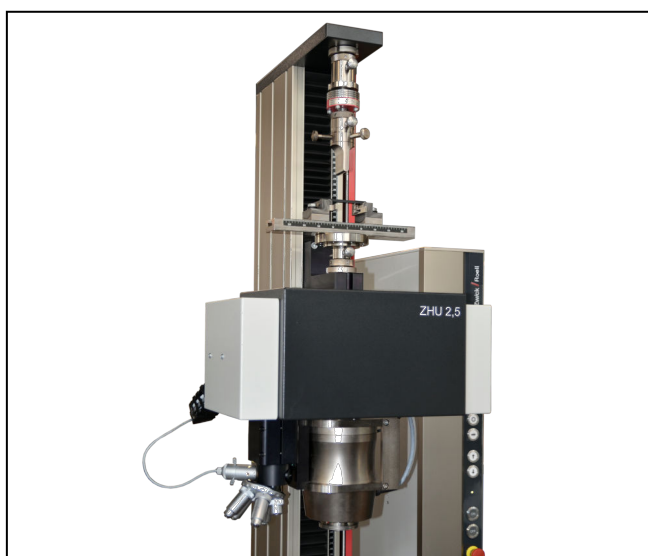
ZHU/zwickiLine+ with the option second test area