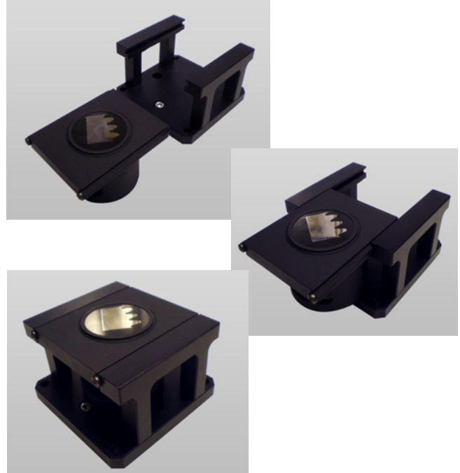
Fig. 2: Specimen mount: separate, sliding in, closed up