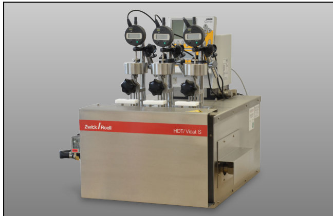
HDT/Vicat 3-300 standard with 3 measuring stations