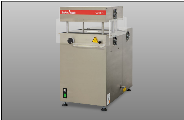
Vicat Dry 2-300-D