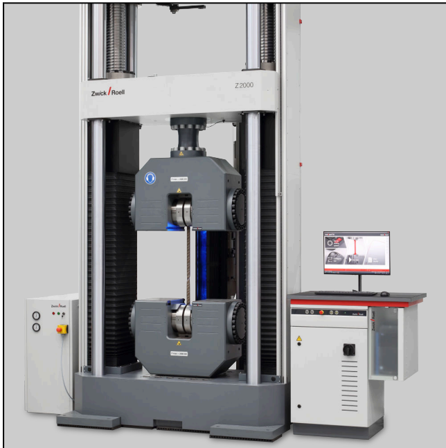
videoXtens 6-680 HP on Z2000E