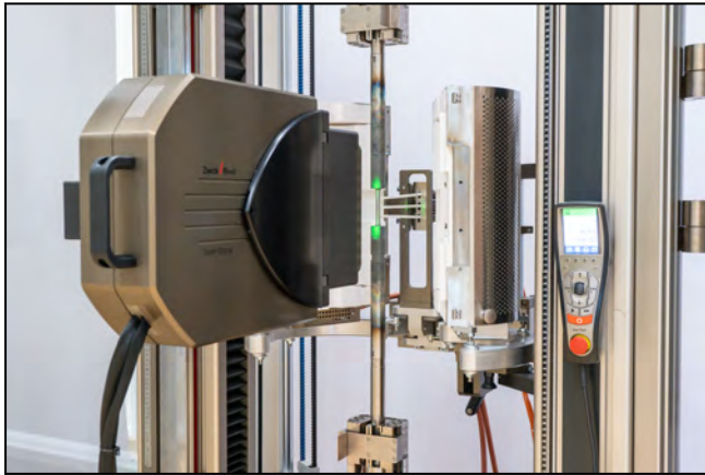
laserXtens 2-120 HP/TZ