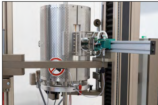
High-temperature contact extensometer up to 1,600 °C