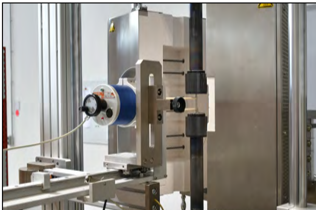
High-temperature contact extensometer up to 1,500 °C