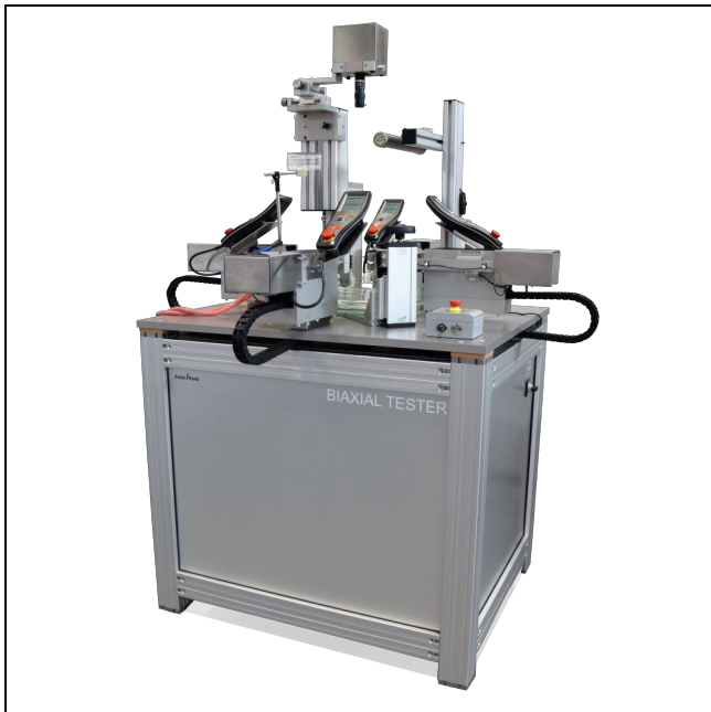
Biaxial testing machine